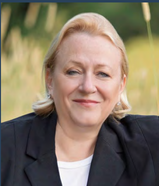
Catherine AUSTIN FITTS